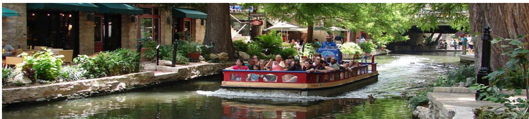
San Antonio Riverboat at Hard Rock Café